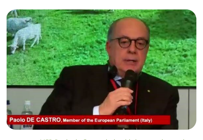
MEP Paolo de Castro during his intervention at the conference, organised by Interbev

Underlining the environmental, economic and social benefits of livestock farming and having a holistic approach when assessing the environmental performance of farming activities is of paramount importance for acknowledging the efforts of thousands of livestock farmers across Europe, including their contribute to the achievement of the environmental and climate goals.