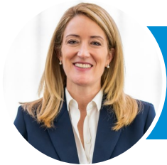
Roberta Metsola, President of the European Parliament