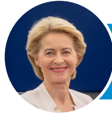
Ursula von der Leyen, President of the European Commission

“ The challenges our Union has faced in the past years have been of unprecedented nature and have undeniably forced us to rethink the way we do things. The world is changing and we must be ready to change with it. This is a team effort. Only together can we build a strong and resilient European future for all. The European agri-food and dairy sector has always been and will continue to be a key pillar of this European future. This is about far more than just food production and farming. It is about supporting our rural communities, promoting sustainable production and healthy consumption, ensuring food security as well as contributing to Europe’s economic prosperity. Ultimately, it is about people.