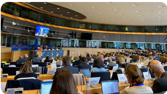
European Parliament's COMAGRI session, 22 March 2023

EDA considers the adopted report balanced for us at the moment, although some details need to be shaped and clarified. We will continue working in the upcoming weeks to improve these few points to boost the full potential of the scheme before its vote in the Plenary. Regarding the timeline, the adopted Report by COMAGRI will be voted on Plenary Session in the upcoming months.