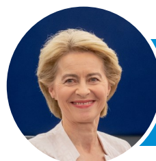
Ursula von der Leyen, President of the European Commission

"The role of the European Dairy Association in ensuring that the voice of your stakeholders is heard in Europe is key. I look forward to continuing our close cooperation to ensure that dairy has a promising future in Europe."