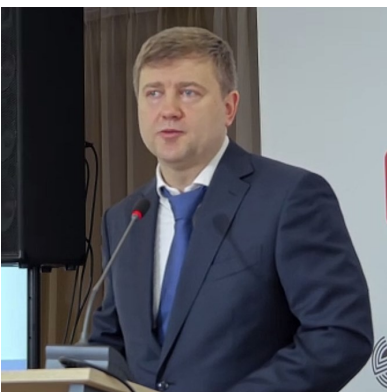
Ukrainian Minister for Agrarian Policy and Food, Vitaliy Koval

Ukrainian Minister for Agrarian Policy and Food, Vitaliy Koval stated in his key-note: "In Ukraine we promote healthy diets, that's why we promote dairy for all consumer groups. Our dairy sector has incredible potential. And we also import European dairy, but we also produce very good dairy in Ukraine, so the consumer is free to choose. I ask all companies and associations to work to advance on our way to the European family – we need close ties at all levels with the European Union. I am in contact with the EU Commission every week – and I know that these are sometimes difficult talks, but that is the only way forward for us."