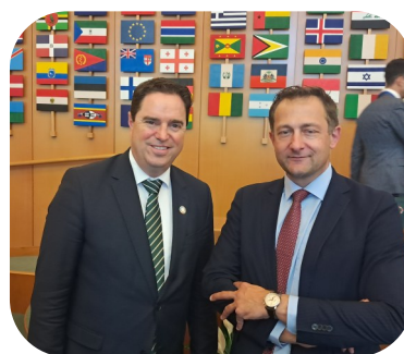
Irish Minister for Agriculture Martin Heydon with EU Commissioner Christophe Hansen