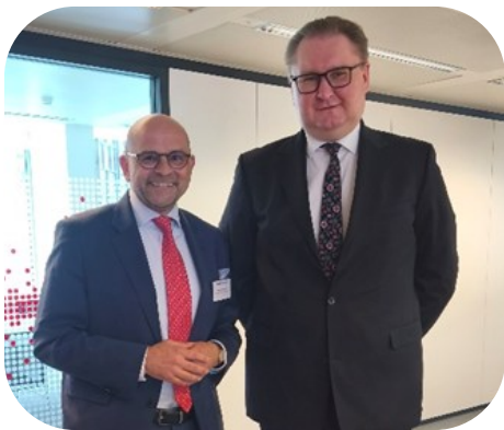
Ukrainian Vice Prime Minister Taras Kachka with EDA's Alexander Anton

"Ukraine not only adds volume, but balance and resilience to the common market and can make European agriculture more robust and more strategically grounded – we need to unlock the full potential of the EU – Ukraine agrifood integration", pleaded Oleksandra Avramenko , the head of the EU Integration Committee and advisor to the Deputy Prime Minister.